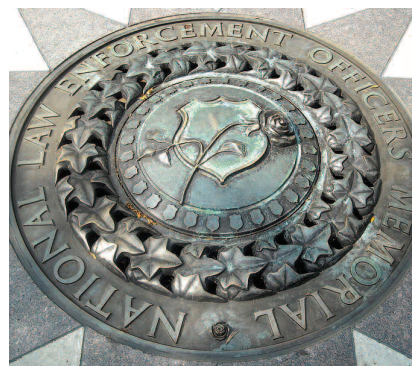
Plaque at the National Law Enforcement Officers Memorial at Judiciary Square in Washington, D.

The roots of National Police Week reach back to 1962, when President John F. Kennedy signed a proclamation that designated May 15th as Peace Officers Memorial Day and the week following as Police Week. In August 1981, the Fraternal Order of Police National Auxiliary Board voted to hold the first National Peace Officers' Memorial Day Service on Capitol Hill at Senate Park the following May. The