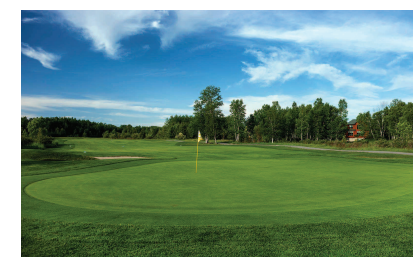
Charlevoix Country Club, now under new management, is thrilled to announce the reopening of Heatherwoods Golf Course and Charlevoix Fitness Center soon.