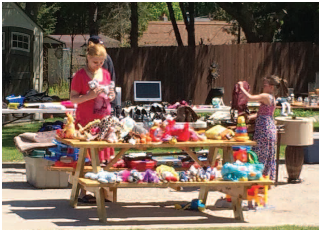
Find lots of great treasures during the 8th annual Garage Sales Across the Breezeway event on May 26 & 27.

Get ready to shop 'til you drop along 26 miles of "Garage Sales Across the Breezeway" on Friday, May 26 and Saturday, May 27 from 9am to 4pm. Besides finding treasures along the Breezeway, be sure to visit the communities of Boyne Falls, East Jordan, Ellsworth and Atwood and their many businesses, attractions and restaurants.