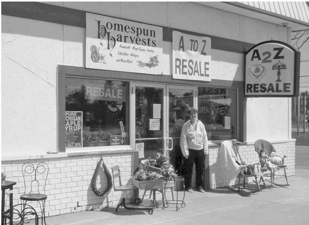
Gaylord's A-2-Z Resale shop and Homespun Antiques & Crafts are now combined in one fantastic new location, at 1961 South Otsego Avenue next to the Gaylord Ace Hardware.

The new A-2-Z Resale/Homespun Arts & Crafts store hours are 10am to 6 pm Monday through Saturday. They are accepting donations during normal business hours. They can be reached by calling (989) 731-4305.