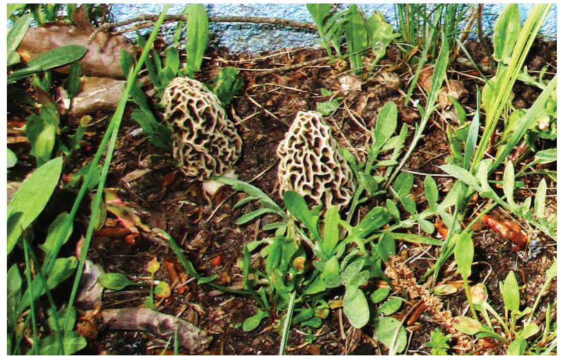
While it's generally believed that morel mushrooms are found only in forests and fields, it's not unusual to find them right outside your own back door, like these few fungi that were found last week growing alongside a garage at a top secret location in northern Michigan.

By Michelle Medjesky Mother's Day for most people brings with it thoughts of flowers and gifts or celebrating mom at Sunday brunch. But for those living in Boyne City, Mother's Day also signals the soon-to-follow celebration of a fungal kind-the National Morel Mushroom Festival-which the city hosts each May on the weekend following Mother's Day. Now in its 57th year, the 2017 National Morel Mushroom Festival promises to be better than ever,