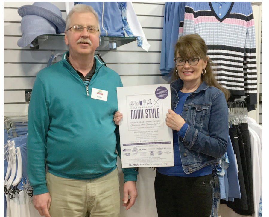
Each year the Charlevoix Area Community Pool holds an annual fundraiser to support pool programming and general operations. This year the event is NOMI STYLE: a Sports Gear and Fashion Expo on Thursday, June 15th at the Bay Harbor Yacht Club, Lange Center.