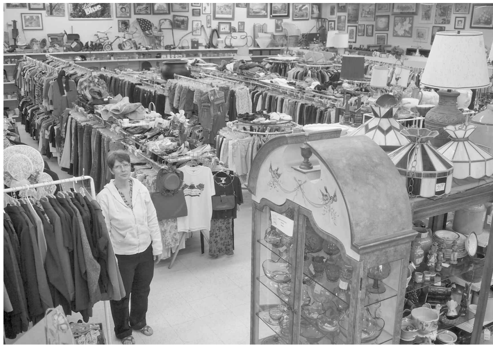
The new location is bright, cheery and well-organized making shopping for terrific bargains a breeze. The resale shop offers just about everything under the sun...or across every letter in the alphabet!