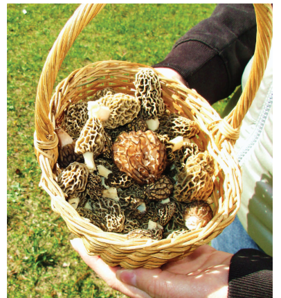
Experts are saying this year's morel mushroom crop looks to be abundant, with bags and baskets quickly being filled, like this one Megan Osier packed with morels she plucked recently at an undisclosed spot in Emmet County.

The Golf Course is expected to be open by Memorial Day weekend.